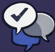
6 PUBLIC DIALOGUES